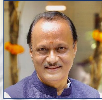
Hon. Shri. Ajit Pawar Dy. Chief Minister, Maharashtra State