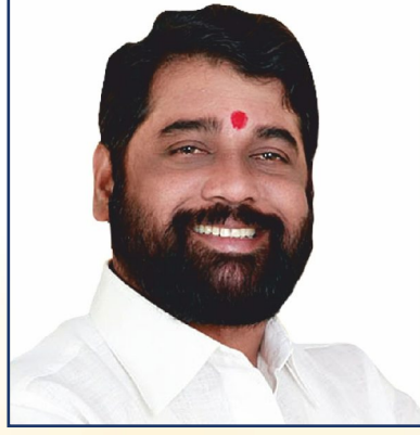
Hon. Shri. Eknath Shinde Chief Minister, Maharashtra State