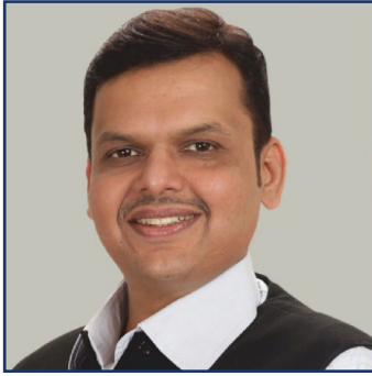
Hon. Shri. Devendra Fadnavis Dy. Chief Minister, Maharashtra State