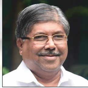
Hon. Shri. Chandrakant Patil Minister, Higher & Technical Education, Government of Maharashtra